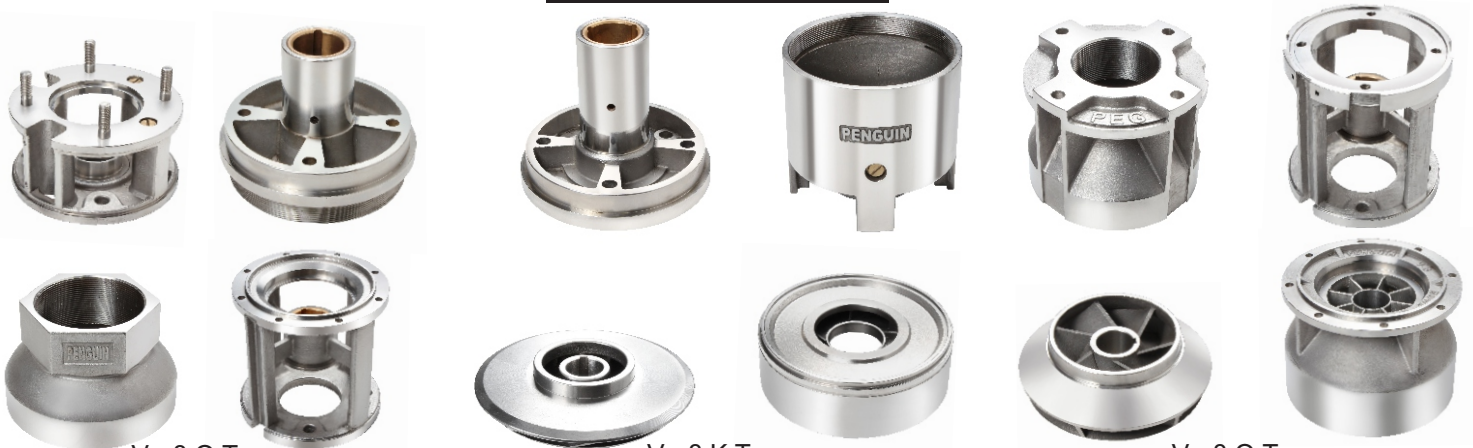
V - 8 Q Type