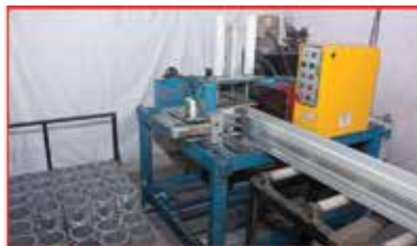
MACHINE SHOP DIVISION