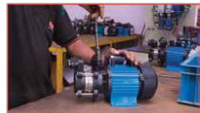
FINAL FITTING DEPARTMENT