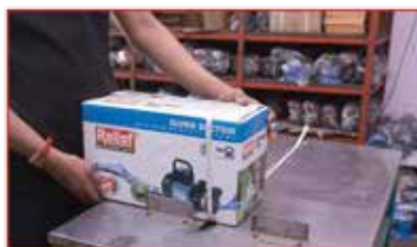
PACKAGING & DISPATCH DIVISION