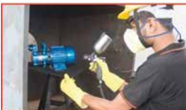
PAINT SHOP DIVISION