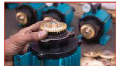
PUMP ASSEMBLY DEPARTMENT