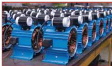
MOTOR ASSEMBLY DEPARTMENT