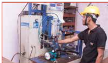
PUMP TESTING LAB