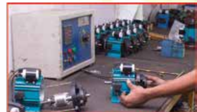
QUALITY CONTROL LAB