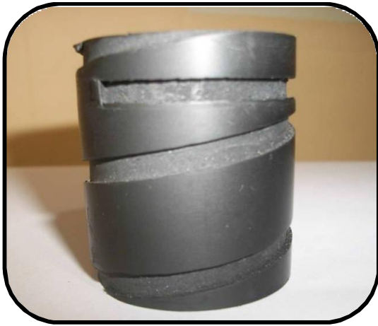
CFT Bushes with OD Groove