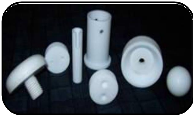
PTFE 'T' Bush