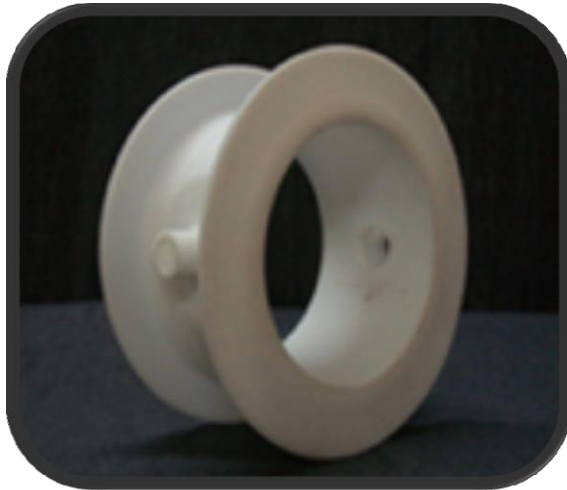
Butterfly Valve Seats (Valve Liners)